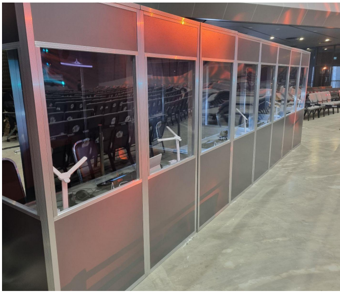
1 of 2 rows of Interpreting Booths